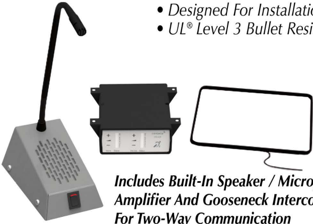
Includes Built-In Speaker / Microphone, Amplifier And Gooseneck Intercom Console For Two-Way Communication