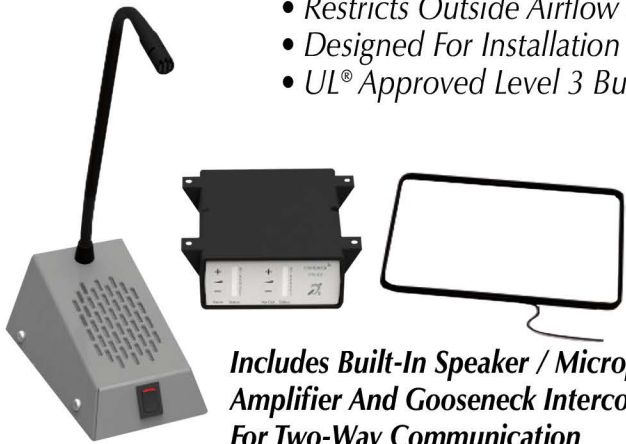
Includes Built-In Speaker / Microphone, Amplifier And Gooseneck Intercom Console For Two-Way Communication