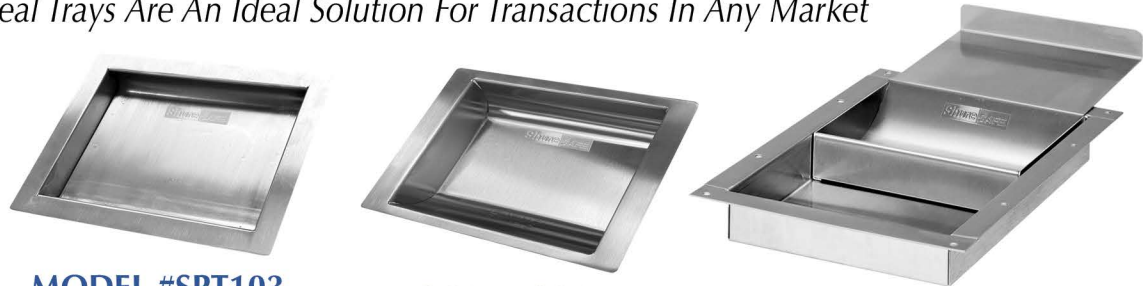
MODEL #SPT103 MODEL #SPT104 Stationary Deal Trays With Non-Ricochet Interior

Deal Trays Are An Ideal Solution For Transactions In Any Market