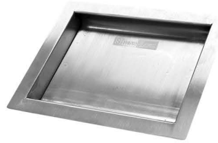
MODEL #SPT103 MODEL #SPT104 Stationary Deal Trays With Non-Ricochet Interior

Deal Trays Are An Ideal Solution For Transactions In Any Market