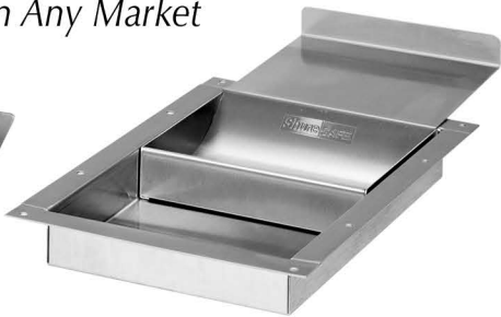
MODEL #SPT094 Sliding Deal Tray