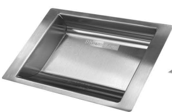
MODEL #SPT100 MODEL #SPT158 MODEL #SPT159 Stationary Deal Trays