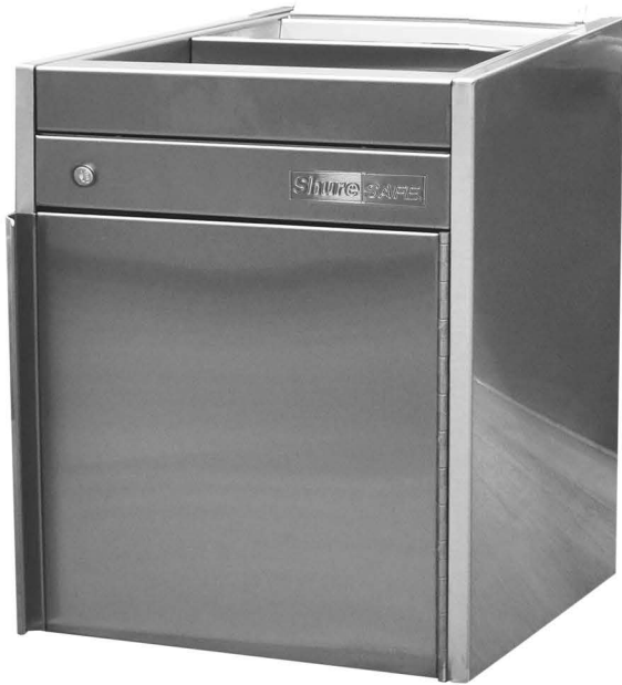
MODEL #SPT355 Package Passer