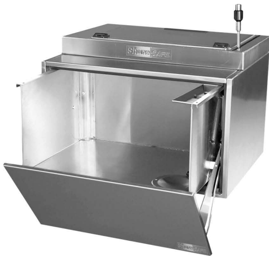
MODEL #SPT301 Left Hand Handle