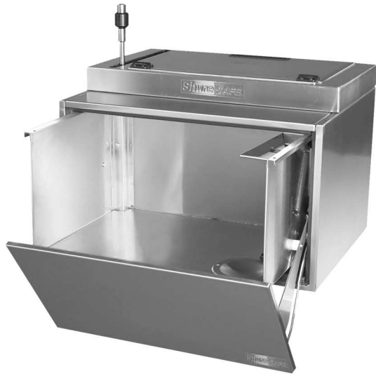
MODEL #SPT300 Right Hand Handle

ER Series Drawers Are Ideal Solutions For Pharmacies, Convenience Stores, Correctional Facilities, Financial Facilities, Fast Food Restaurants & Government Facilities